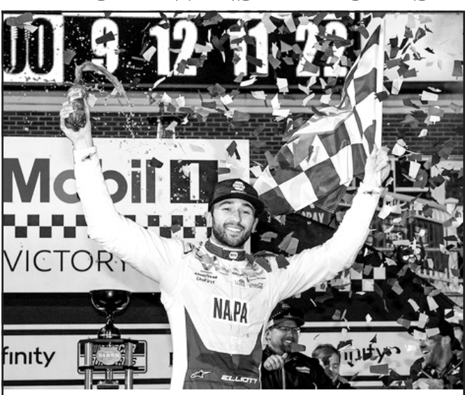
Elliott Wins The Clash to get to Daytona. It's a great way to start the season."

"Yeah, fortunately it worked out. Great way to start the season. Huge thanks to everybody at Hendrick Motorsports, a lot of hard work over the off-season. Excited