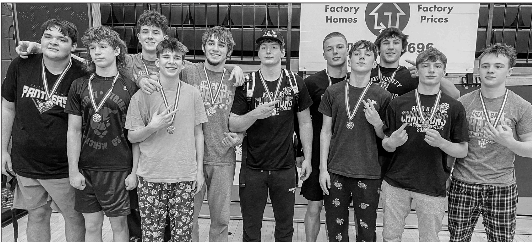
The Union County men qualified 11 wrestlers for this weekend's Class AA State Sectionals.